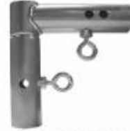
French Wall Ell