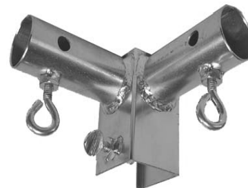
EZ StaBar 3 Way

1. Set up canopy as usual. Slip EZ StaBar 3-Way Joints onto the bottom of the rear legs and Ell Joints onto the front legs. Tighten thumbscrews until the joints are held in place against the legs. Finger tighten only – although the joint will flare slightly as you tighten, it is not necessary to apply great pressure when tightening.