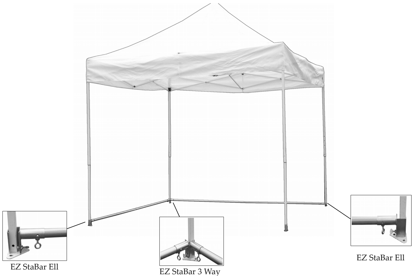
EZ StaBar Ell

3. Click StaBar poles into StaBar Joints at corners. You may need to adjust the position of the joints on the legs in order to keep StaBars level if you've shortened any of the canopy legs to compensate for uneven terrain. This should be done prior to inserting the StaBar poles.